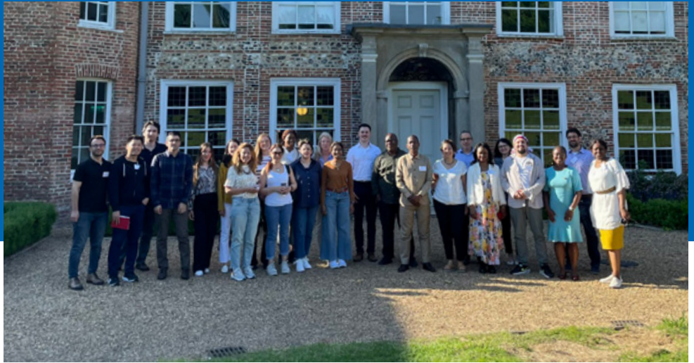
↑ Postgraduate research participants at the 2nd annual Eastern Arc Colloquium.

On 24-25 June 2024, Essex Law School participated in the 2nd annual Eastern Arc Postgraduate Research Colloquium co-organised by the Essex, East Anglia and Sussex Law Schools and held at Earlham Hall, Norwich.