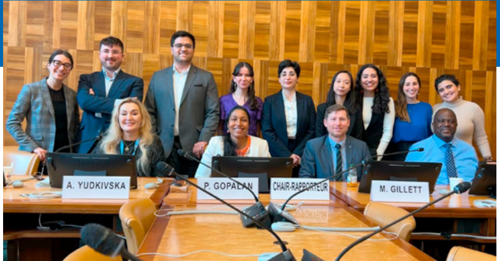
↑ Members of the Essex ADRU meet with UN Special Mandate Holders in Geneva.