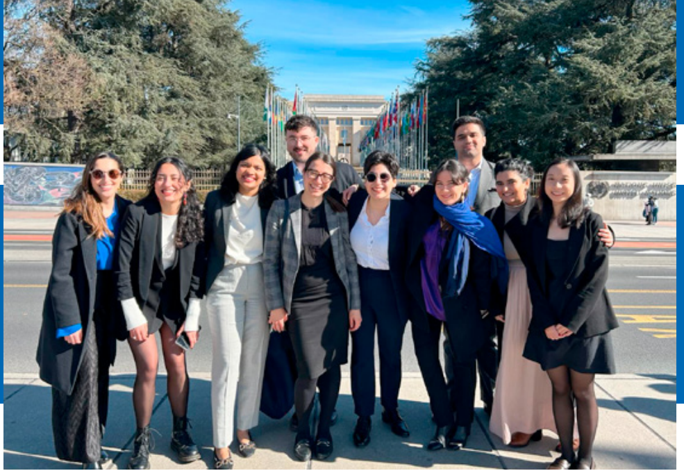
↑ Visit to the UN headquarters in Geneva of the Arbitrary Detention Redress Unit team in April 2024.

Our reports also inform the practice and general understanding of international organisations. As part of the Arbitrary Detention Redress Unit, one of the projects of the Human Rights Centre Clinic, students have contributed research that formed the basis of thematic reports of the UN Working Group on Arbitrary Detention, for example, on detention pursuant to disinformation laws, in the context of COVID-19, and of environmental human rights defenders. Over the course of two academic years, the team assisted the UN Working Group on at least 16 individual